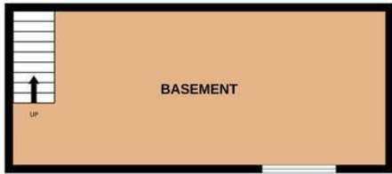
BASEMENT 313 sq.ft. (29.1 sq.m.) approx.