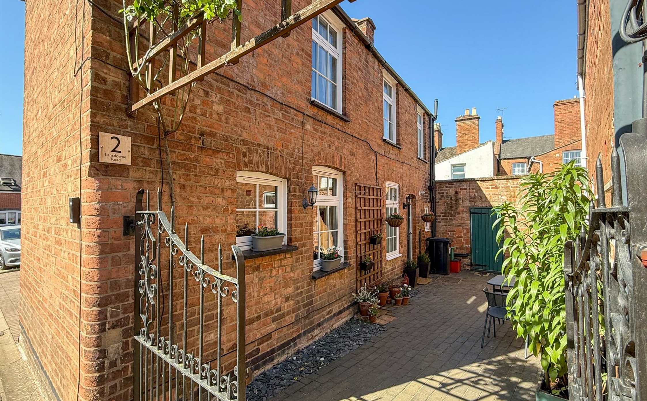
2 Lansdowne Road, Leamington Spa, CV32 4SS Guide Price £325,000